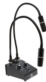
Lightning 4 part no 26800B-221