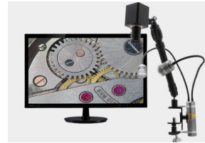
Mighty Cam - Microscopy