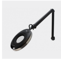
Magnifying Lamps & Accessories