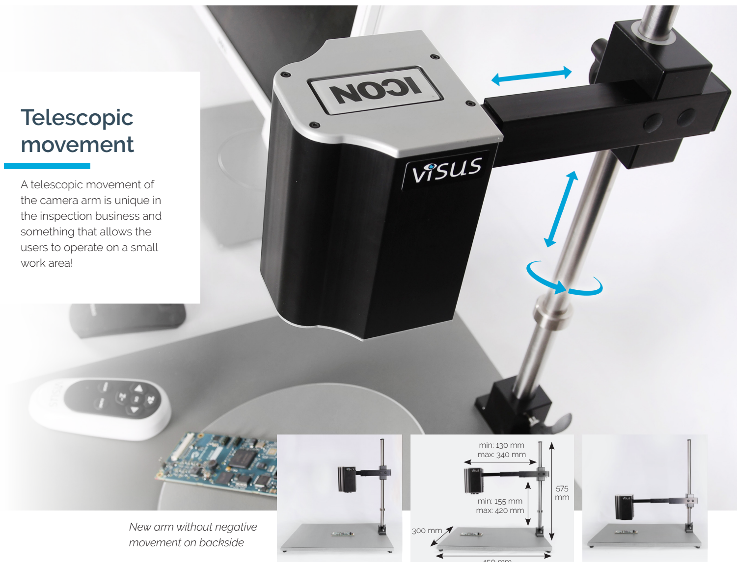
New arm without negative movement on backside

A telescopic movement of the camera arm is unique in the inspection business and something that allows the users to operate on a small work area!