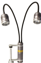
Lightning 1 part no 26800B-519