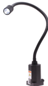
Lightning 2 part no 26527