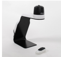
Cmore Digital camera microscope